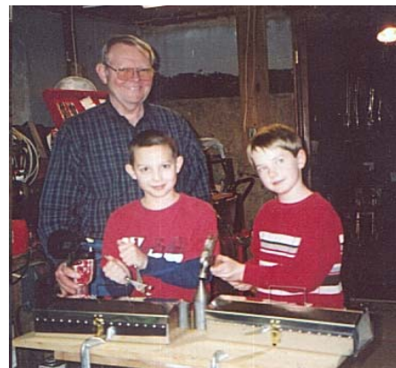
Complete and ready to go!